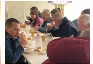
A filling, mid-day meal served at the soup kitchen.